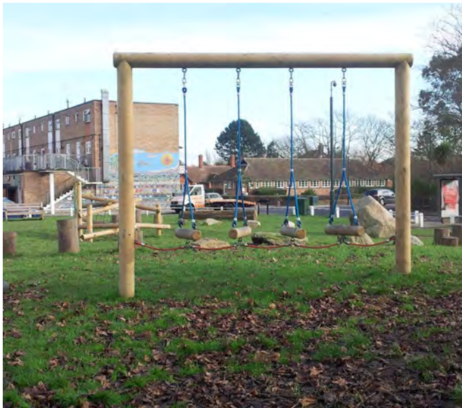
FIGURE 2 AND 3 ABOVE. HAM HAS A GOOD SELECTION OF SHOPS WITHIN A FIVE MINUTES WALK OF MOST RESIDENTS’ HOMES; HAM GREEN IS A MUCH LOVED PUBLIC OPEN SPACE.

LBRuT and RHP wanted to develop the concept options for the future of Ham Close on the basis of the input gathered from Ham Close residents and those living in the surrounding area during both the public open sessions and the drop in sessions. As part of the EbD process, The Prince’s Foundation used two exercises to gather this input during these sessions. Thereafter the input was consolidated and used to inform the five key principles described in this section, upon which the vision, approaches and concepts were then based.