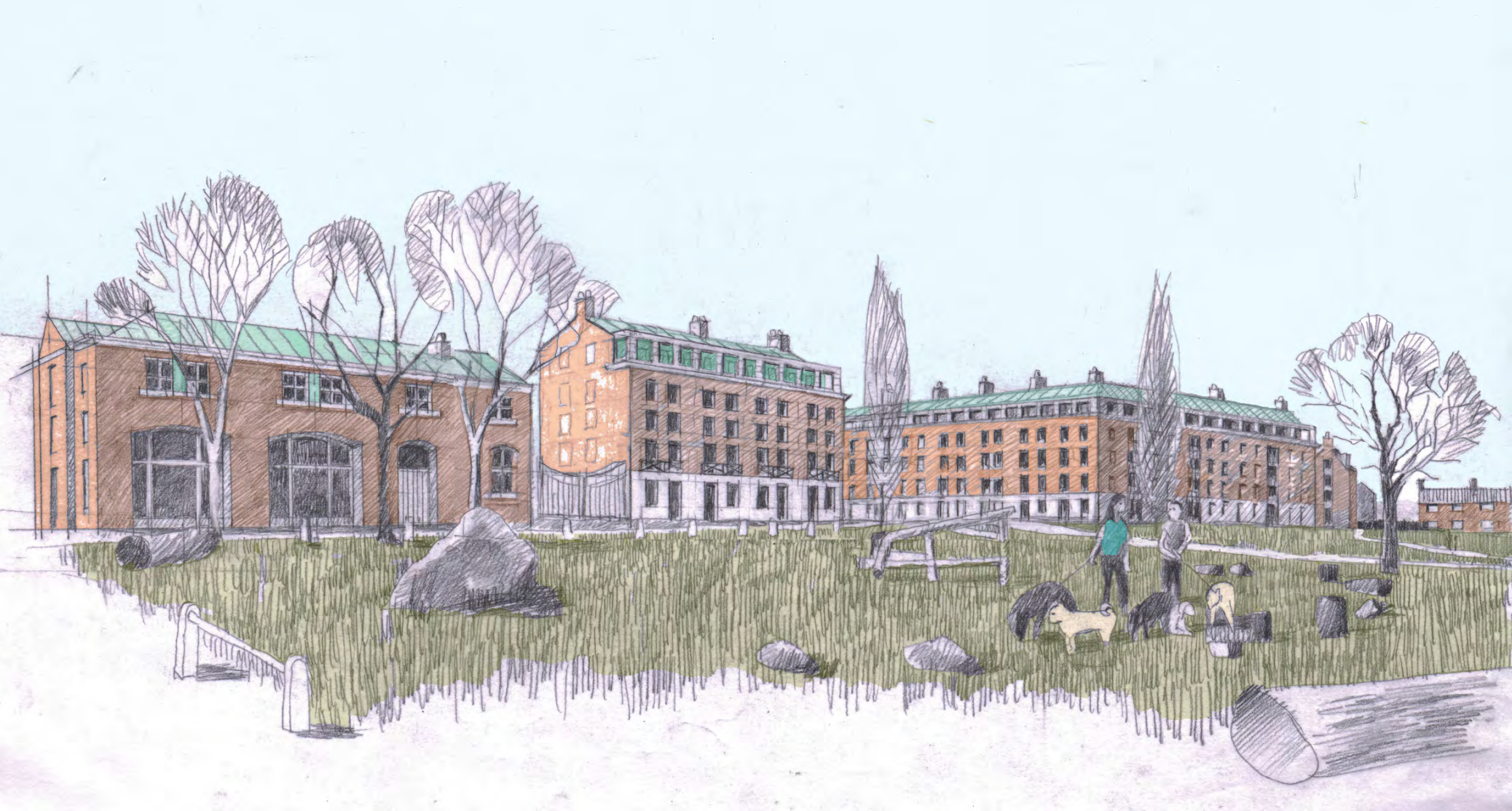
FIGURE 15. ARTIST’S IMPRESSION OF CONCEPT 3A: ACROSS THE GREEN WHEN STANDING NEAR THE SHOPS

NOTE: ARTIST’S IMPRESSIONS ARE MERELY A REPRESENTATION OF WHAT THE APPROACH COULD LOOK LIKE TO ASSIST IN VISUALISING THE URBAN FORM (SITE LAYOUT, BUILDING HEIGHT AND SCALE). ARTIST’S IMPRESSIONS ARE NOT AN INDICATION OF ARCHITECTURAL STYLE.