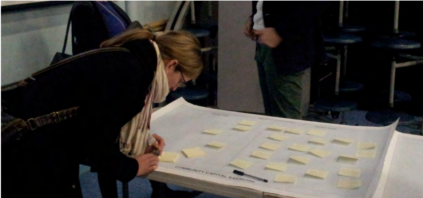
FIGURE 4. GATHERING LOCAL INPUT DURING THE FIRST PUBLIC OPEN SESSION