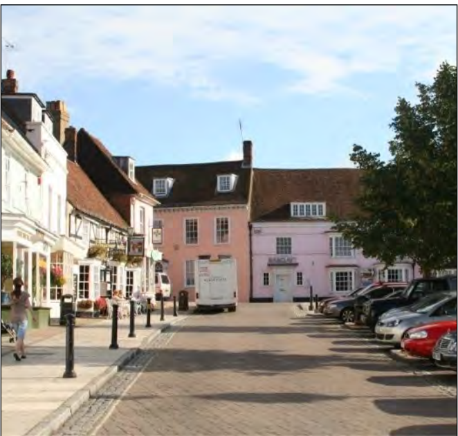
FIGURES 17-20 ABOVE. EXAMPLES OF SUCCESSFUL VILLAGE GREENS