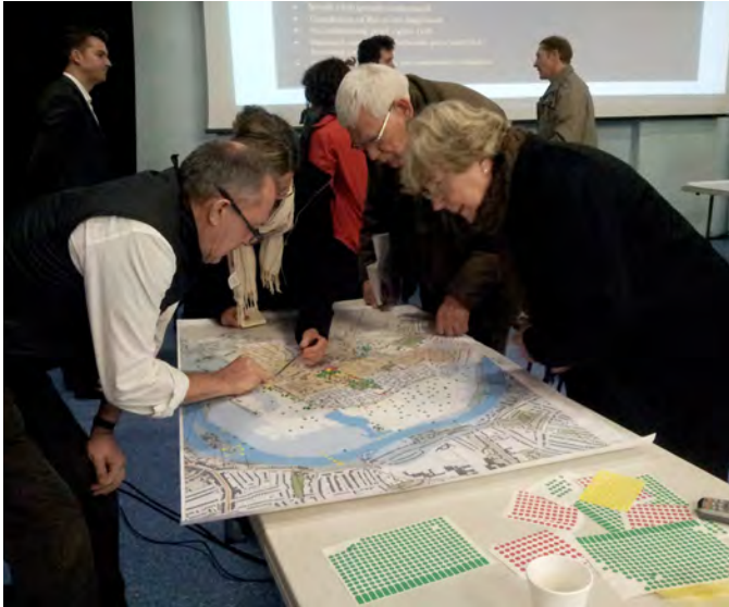
FIGURE 5. GATHERING LOCAL INPUT DURING THE FIRST PUBLIC OPEN SESSION