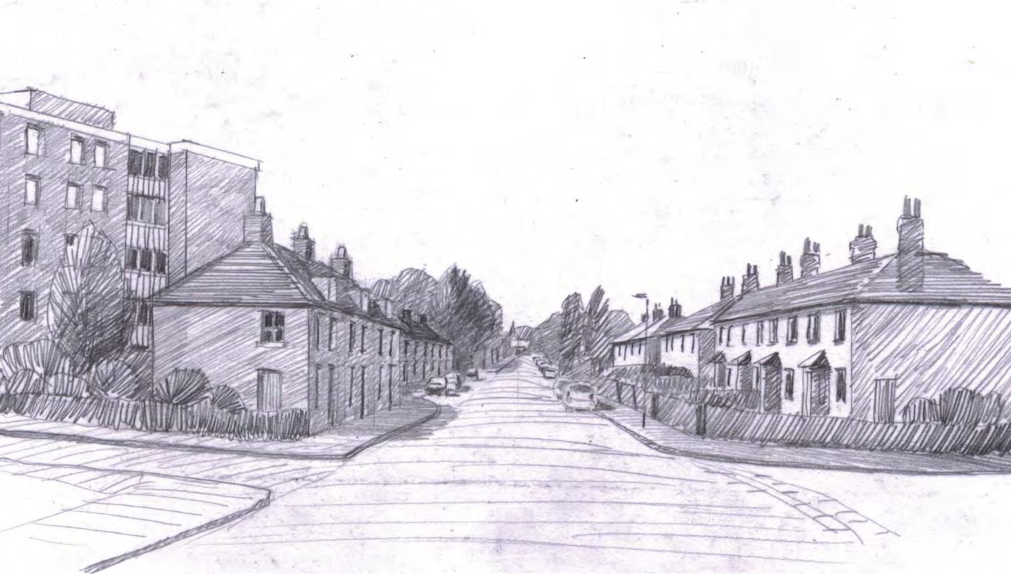
FIGURE 12. ARTIST’S IMPRESSION OF APPROACH 2 - WOODVILLE ROAD, HAM (HAM CLOSE/ NEW BUILDINGS ON LEFT)

NOTE: ARTIST’S IMPRESSIONS ARE MERELY A REPRESENTATION OF WHAT THE APPROACH COULD LOOK LIKE TO ASSIST IN VISUALISING THE URBAN FORM (SITE LAYOUT, BUILDING HEIGHT AND SCALE). ARTIST’S IMPRESSIONS ARE NOT AN INDICATION OF ARCHITECTURAL STYLE.