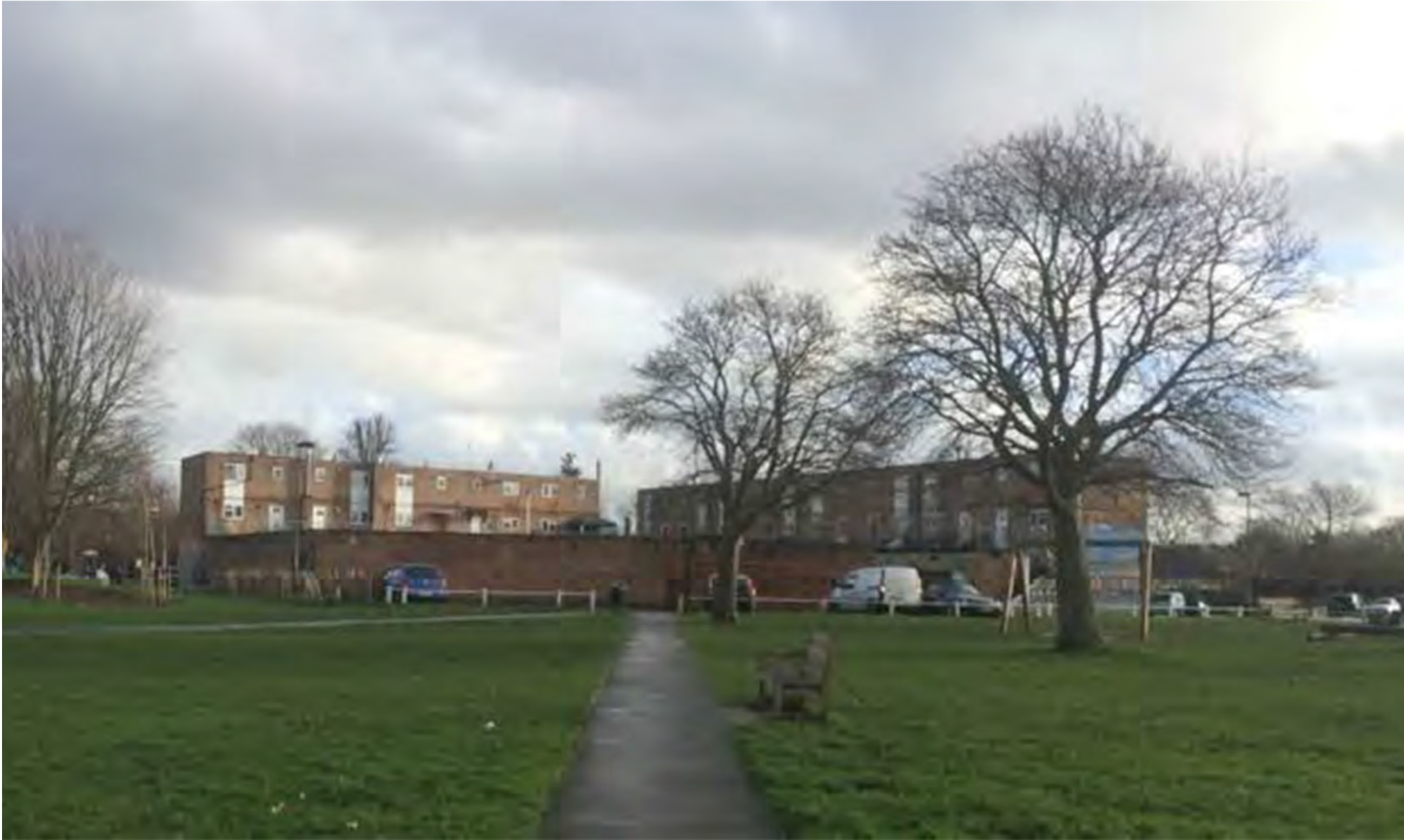
FIGURE 21. THE EDGE OF THE GREEN AS EXISTING