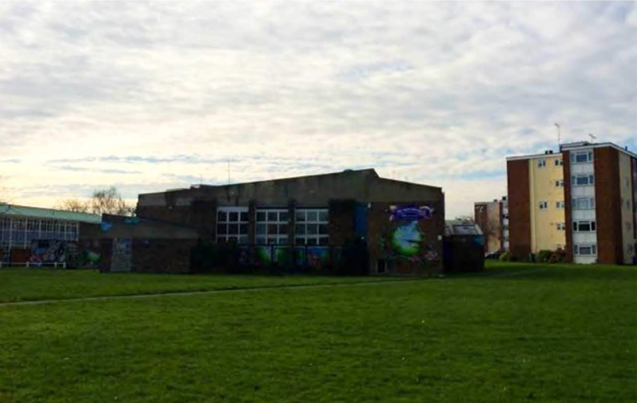
FIGURE 14. CONCEPT 3A: ACROSS THE GREEN AS EXISTING