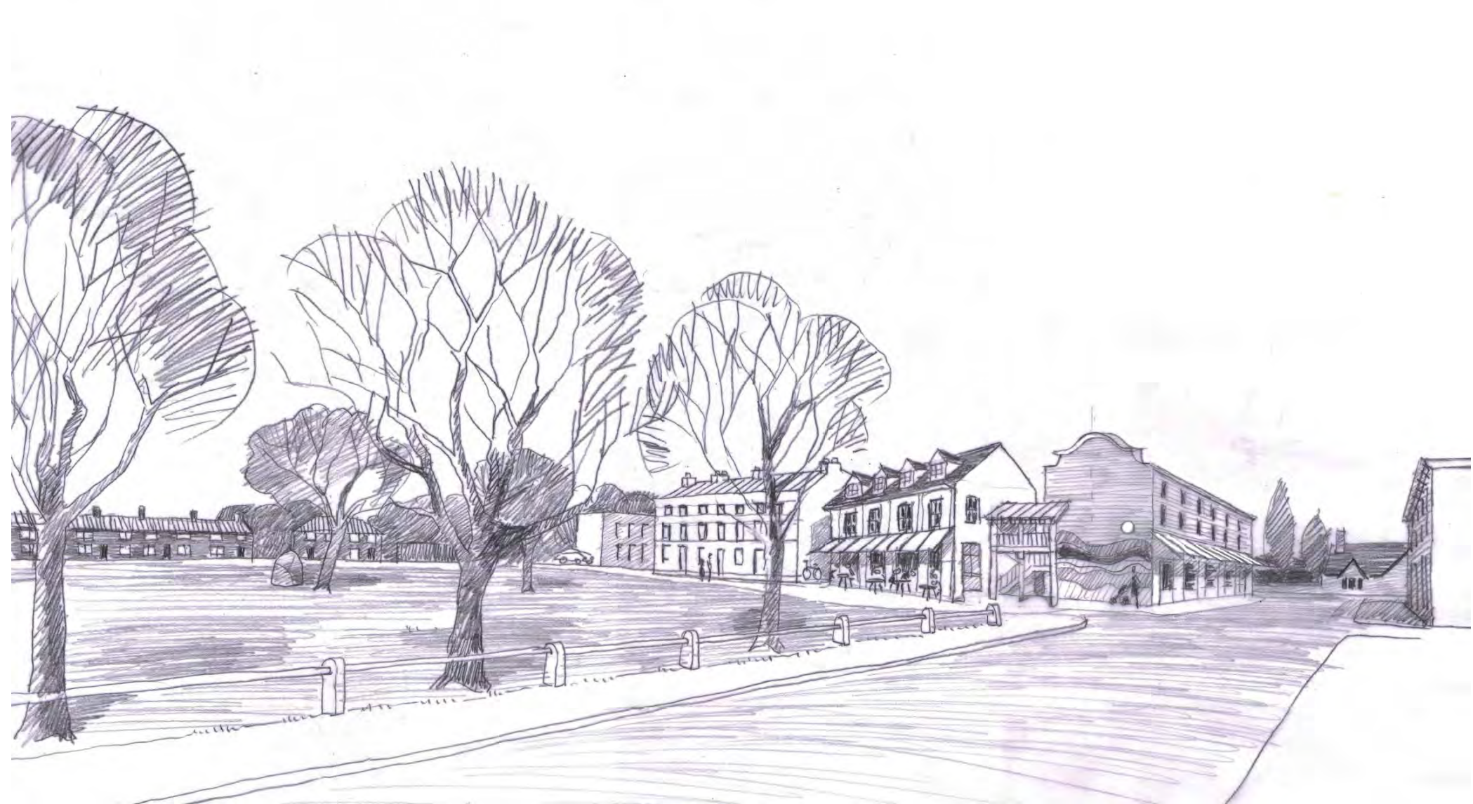
FIGURE 22. ARTIST'S IMPRESSION OF ENCLOSING THE GREEN

NOTE: ARTIST'S IMPRESSIONS ARE MERELY A REPRESENTATION OF WHAT THE APPROACH COULD LOOK LIKE TO ASSIST IN VISUALISING THE URBAN FORM (SITE LAYOUT, BUILDING HEIGHT AND SCALE). ARTIST'S IMPRESSIONS ARE NOT AN INDICATION OF ARCHITECTURAL STYLE.