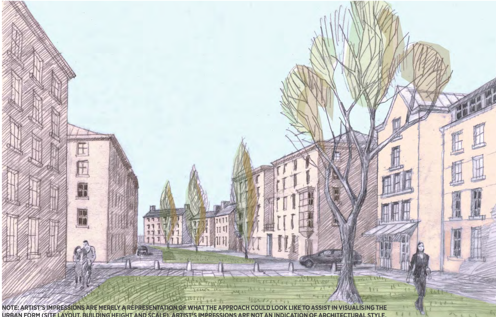
FIGURE 23. ARTIST'S IMPRESSION OF CONCEPT 3B: VIEW THROUGH CENTRAL GREEN SPACE