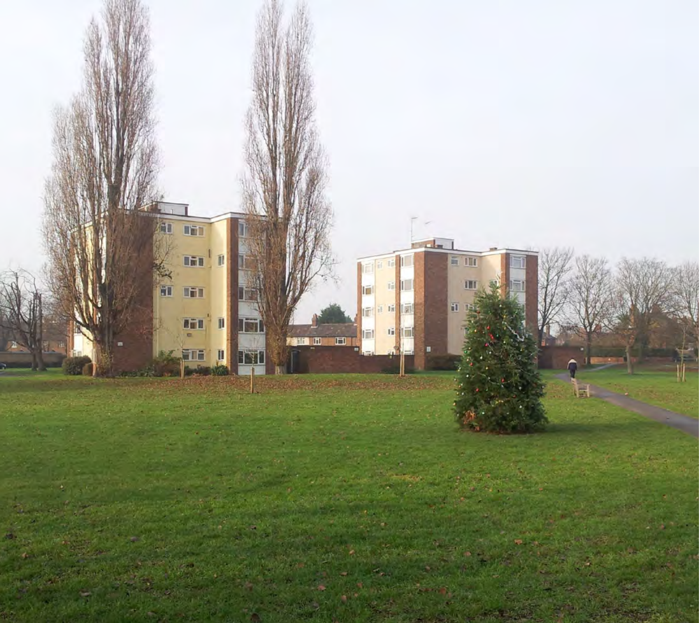
FIGURE 6. HAM GREEN - RETAIN AND ENHANCE GREEN SPACE