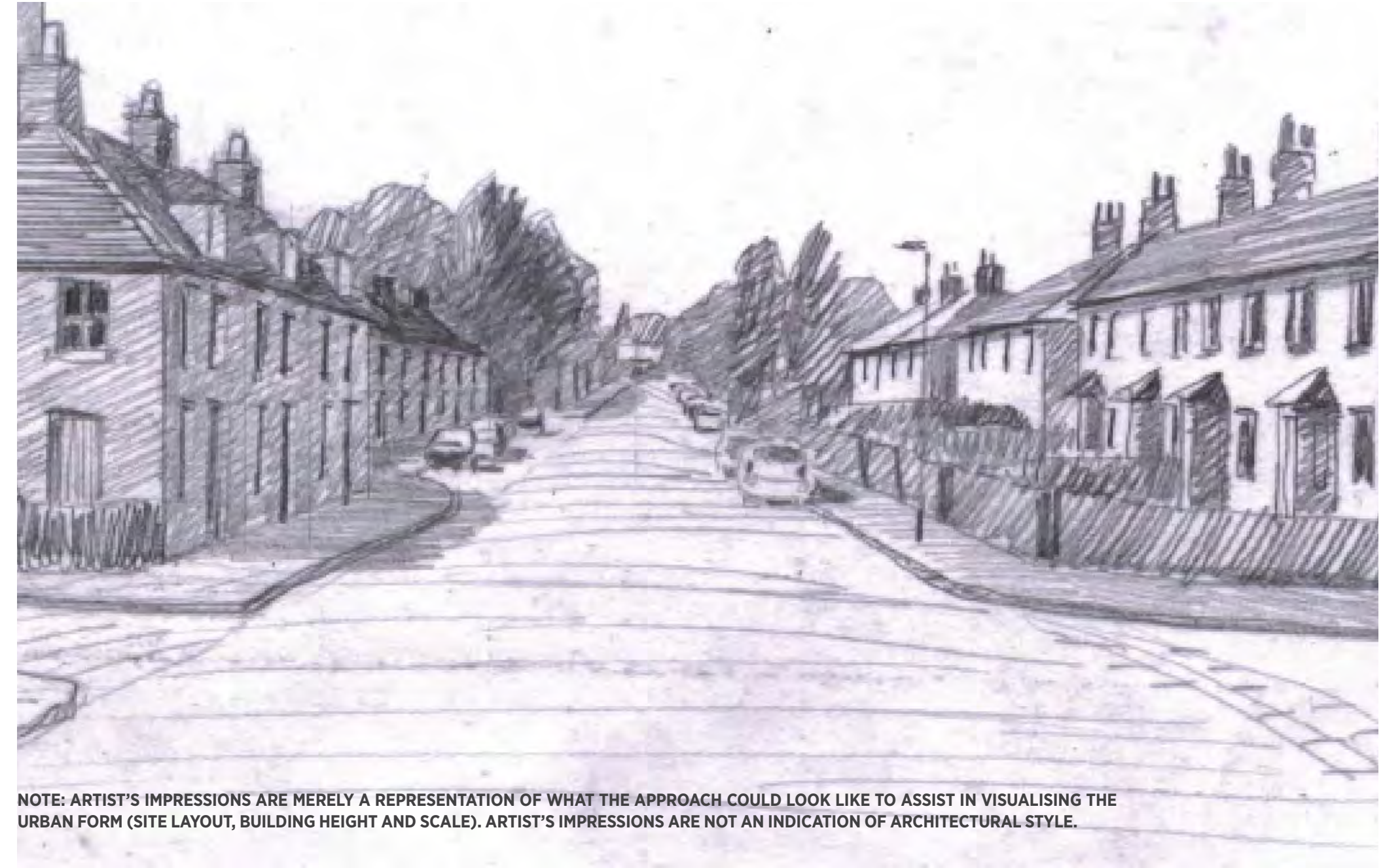
FIGURE 24 ARTIST'S IMPRESSION OF CONCEPT 3A AND 3B: WOODVILLE ROAD (NEW BUILDINGS ON THE LEFT)