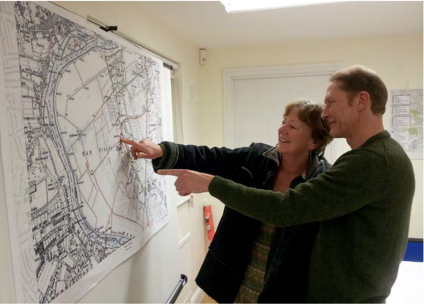
FIGURE 1 HISTORICAL DRAWINGS ON DISPLAY DURING THE WORKSHOP

The Prince’s Foundation believes that effective and continuous community engagement and co-design in the planning process leads to greater community empowerment and leadership- essential elements of success and sustainability.