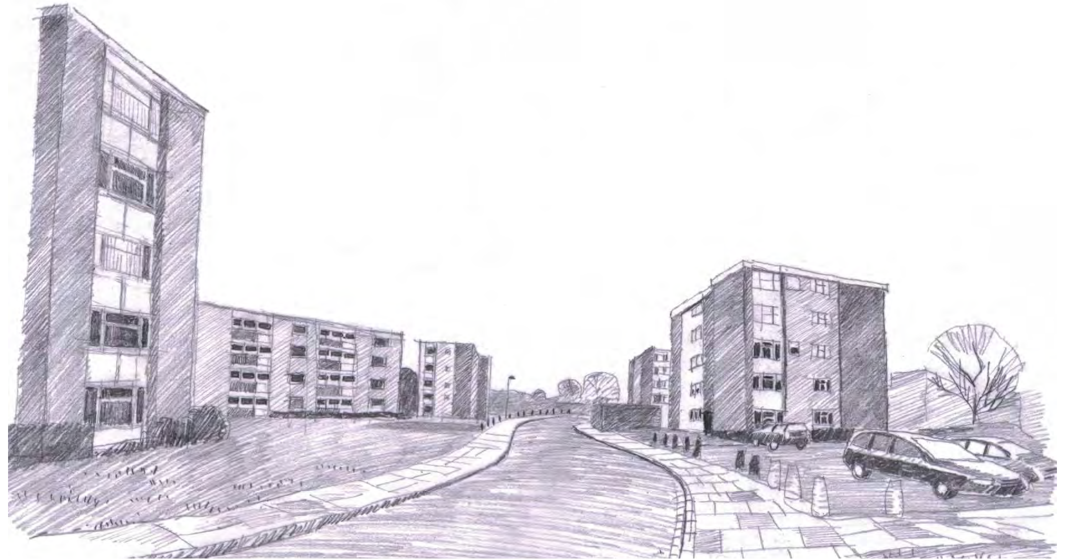
FIGURE 8 AND 9 ABOVE AND OPPOSITE. HAM CLOSE AS EXISTING AND ARTIST'S IMPRESSION OF APPROACH 1 - RETROFIT