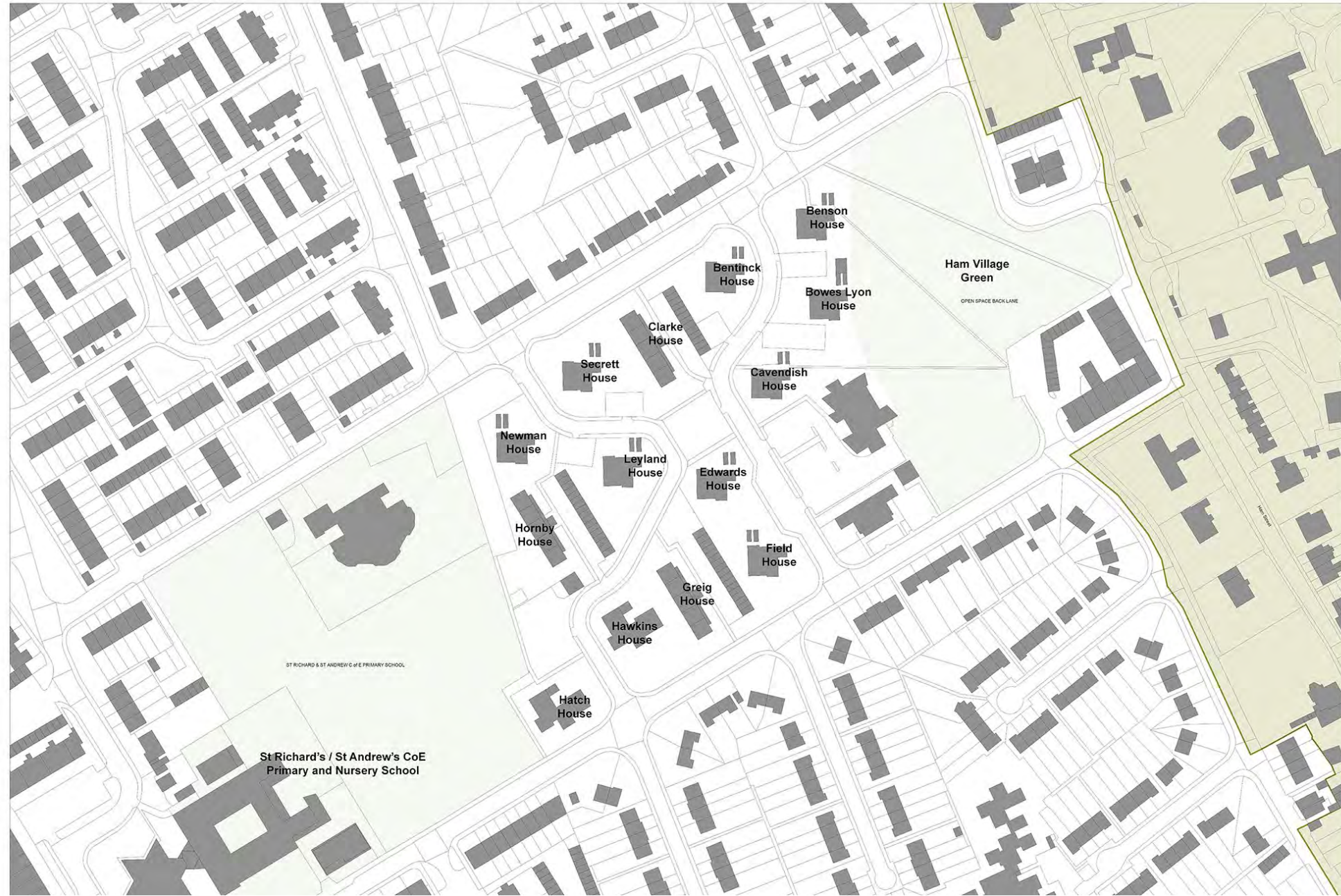
FIGURE 7. PLAN OF HAM CLOSE AS EXISTING