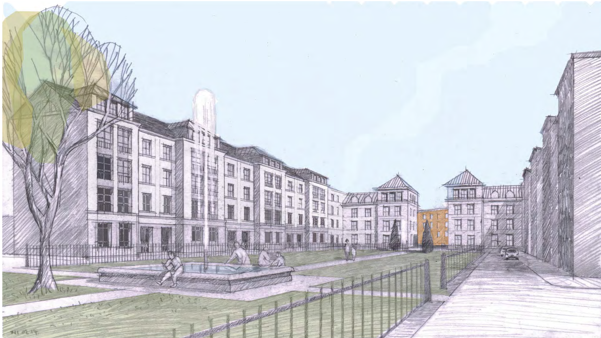
FIGURE 25. CONCEPT 3C: IMPRESSION: THE HEART OF HAM

NOTE: ARTIST'S IMPRESSIONS ARE MERELY A REPRESENTATION OF WHAT THE APPROACH COULD LOOK LIKE TO ASSIST IN VISUALISING THE URBAN FORM (SITE LAYOUT, BUILDING HEIGHT AND SCALE). ARTIST'S IMPRESSIONS ARE NOT AN INDICATION OF ARCHITECTURAL STYLE.