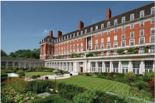
Star & Garter, Richmond Hill