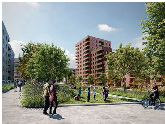
London Square Holloway with Peabody HA